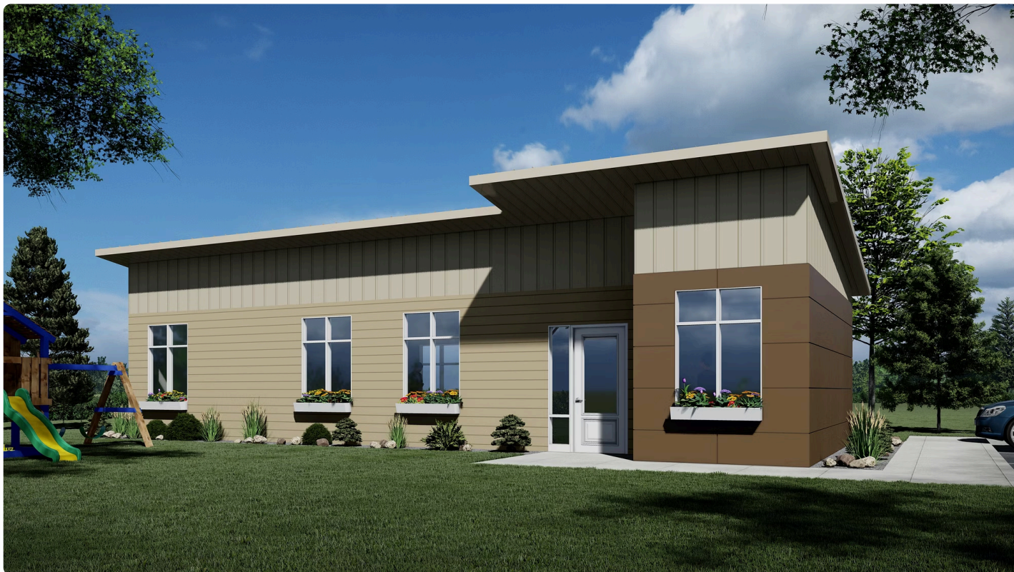
Rendering of Child Care House